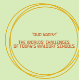
Inna Sviridova (Ukraine)